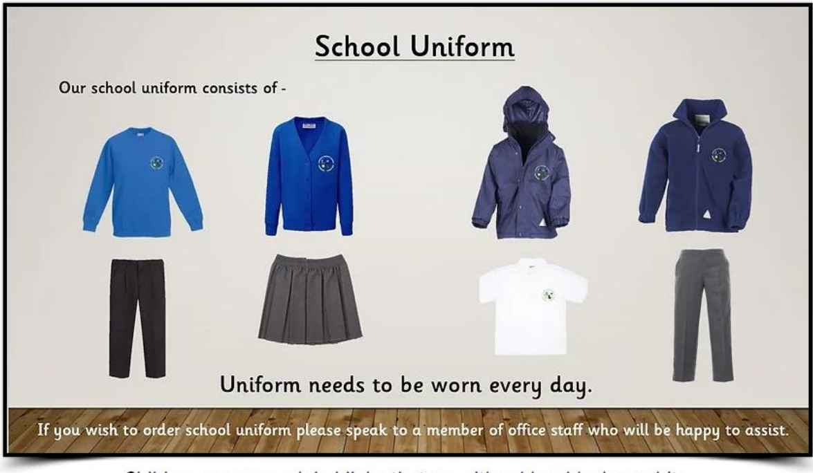
Children can wear plain hijabs that are either blue, black or white.

Uniform does not have to contain the school logo.